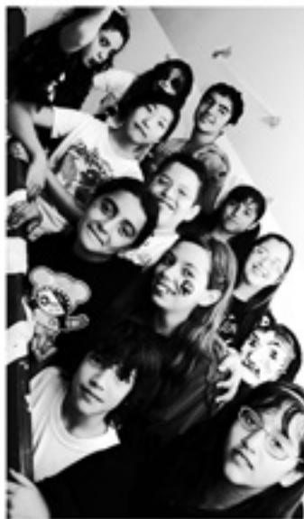
6th Grade takes a time out from the spooks to pose for a picture.